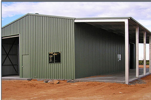
Worker's living quarters